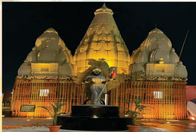
Bharat Mata Temple