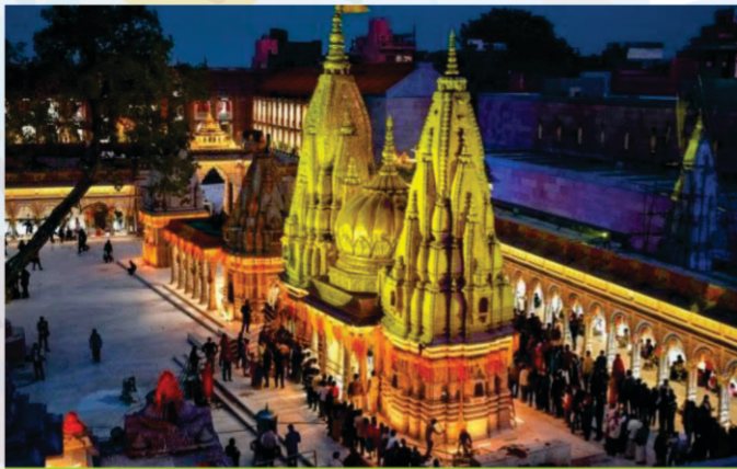
Shri Kashi Vishwnath Temple