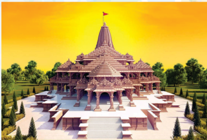
Upcoming Ram Mandir, Ayodhya